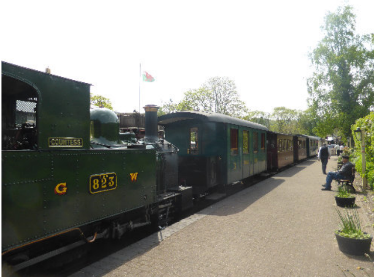
Our train in Llanfair station