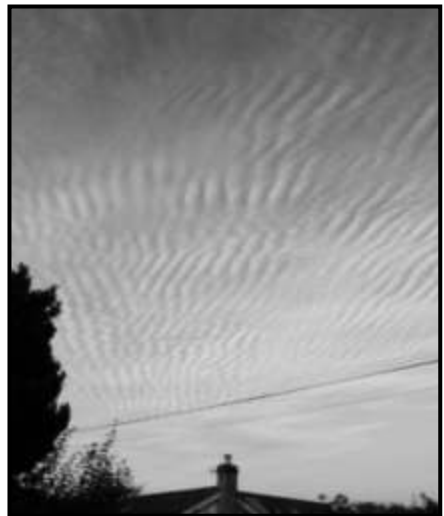
Thanks to Jo Slayman for this photo of an unusual cloud formation over Dilwyn on 4th June. (Cirrostratus undulatus.)