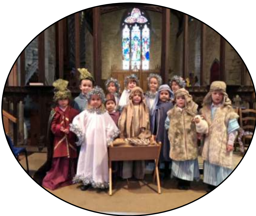
Pupils of St Mary's School rehearsing for their Nativity Play