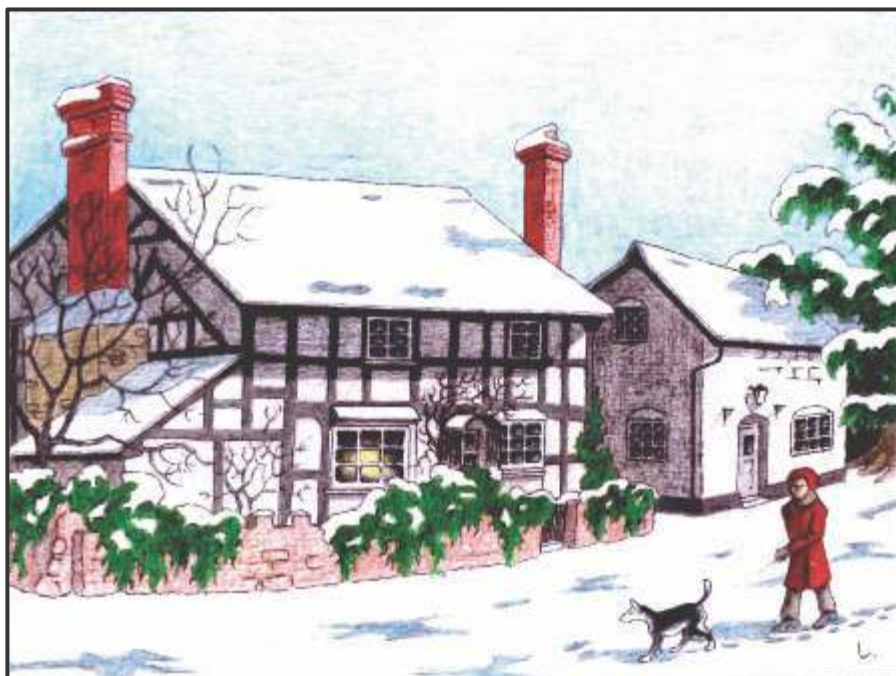
Dilwyn Royal British Legion Christmas card for 2019 – "The Old Forge" (please see page 7 for details of how to purchase)