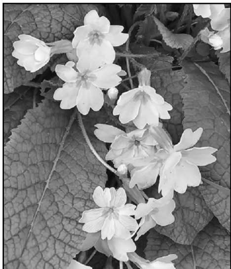
Primrose (prima rosa means first rose).