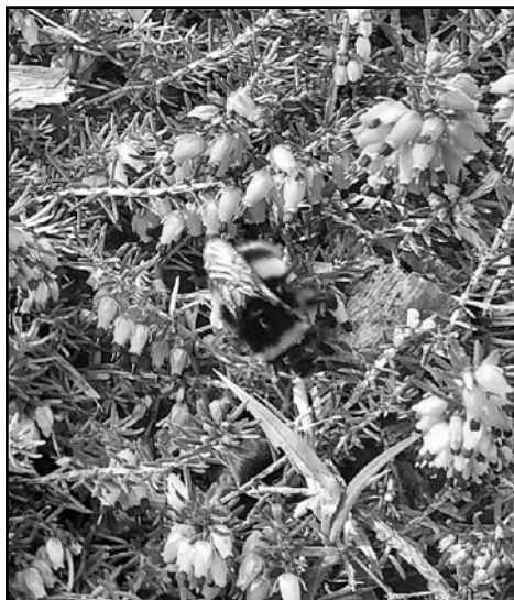
Pink Heather buzzing with buff or white tailed bumblebee